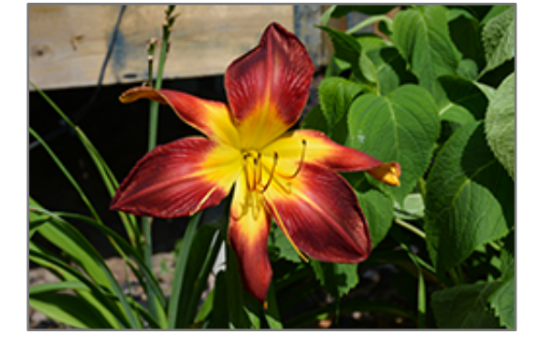
Rainbow Rhythm Ruby Spider Daylily flowers