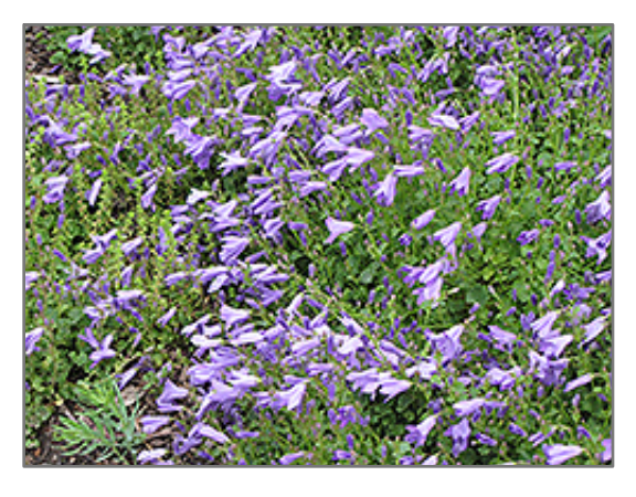
Birch Hybrid Bellflower in bloom