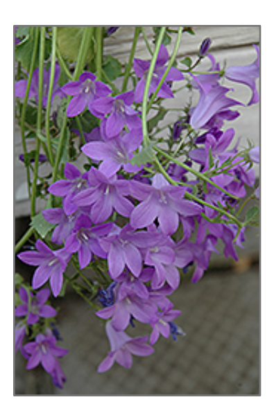
Birch Hybrid Bellflower flowers

Birch Hybrid Bellflower is recommended for the following landscape applications;