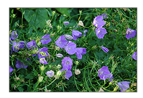
Carpathain Bellflower flowers

Low growing with a compact habit, this variety features beautiful upward facing, cream, lavender, or blue bell-shaped flowers; low maintenance and fast growing, perfect for beds, borders, patio containers and hanging baskets