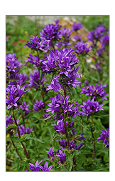
Clustered Bellflower flowers