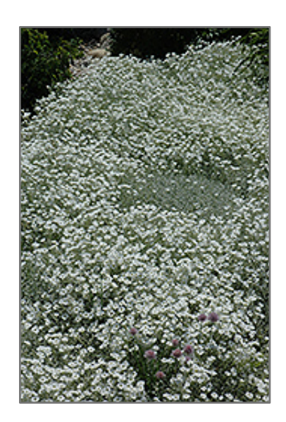
Snow-In-Summer in bloom

Snow-In-Summer will grow to be about 8 inches tall at maturity, with a spread of 24 inches. Its foliage tends to remain low and dense right to the ground. It grows at a fast rate, and under ideal conditions can be expected to live for approximately 10 years. As an evegreen perennial, this plant will typically keep its form and foliage year-round.