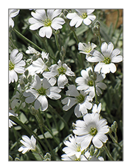
Snow-In-Summer flowers