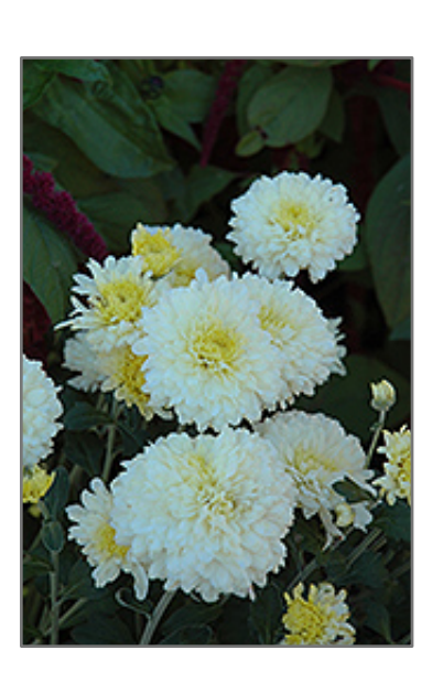
Morden Cameo Chrysanthemum flowers