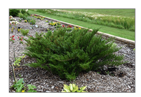
Savin Juniper

An old favorite for massing effect in the landscape, a wide spreading and sprawling shrub with widely arching branches and a soft texture, can grow quite large; best used in groupings for architectural effect; many refined cultivars are available