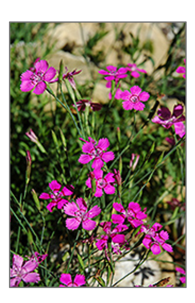
Alpine Pinks flowers

A low growing, mat forming selection ideal for rock gardens, beds or containers; a sun loving variety blooming in late spring to early summer; features narrow green foliage with filly fuchsia blooms with white centers; easy to grow and low maintenance