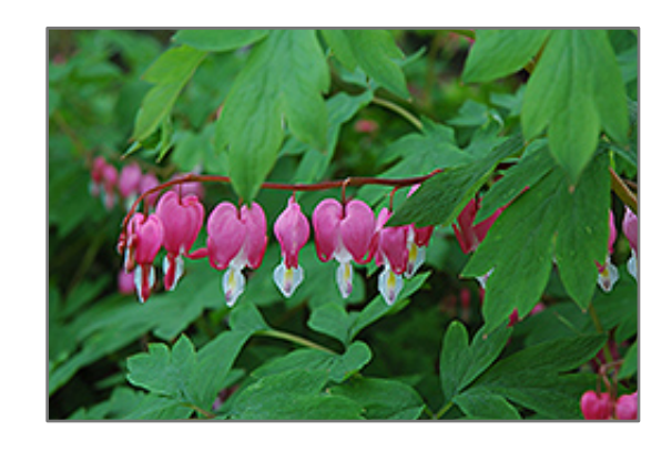
Common Bleeding Heart flowers

Common Bleeding Heart is an herbaceous perennial with a mounded form. Its relatively fine texture sets it apart from other garden plants with less refined foliage.