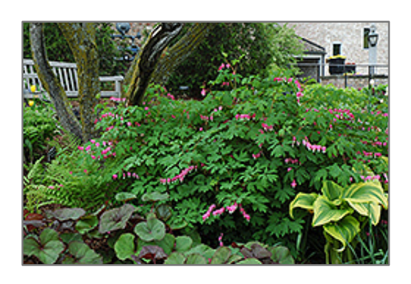
Common Bleeding Heart in bloom

This plant will require occasional maintenance and upkeep, and should be cut back in late fall in preparation for winter. It is a good choice for attracting butterflies to your yard, but is not particularly attractive to deer who tend to leave it alone in favor of tastier treats. It has no significant negative characteristics.