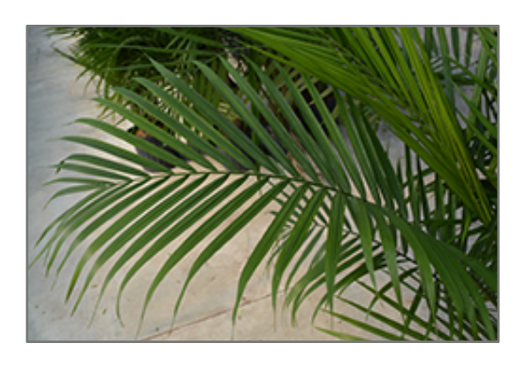
Dypsis foliage