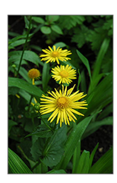
Leopard's Bane flowers

Leopard's Bane has masses of beautiful lemon yellow daisy flowers at the ends of the stems in late spring, which are most effective when planted in groupings. The flowers are excellent for cutting. Its serrated heart-shaped leaves remain dark green in colour throughout the season.