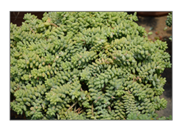
Burro's Tail

A highly desirable and popular houseplant, with trailing stems covered with succulent, tear shaped sea-green leaves; red, yellow, or white flowers possible in late summer; a great tabletop accent or gracefully draping from hanging baskets