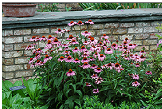
Magnus Coneflower in bloom