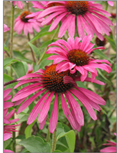
Ruby Star Coneflower flowers

Ruby Star Coneflower is recommended for the following landscape applications;