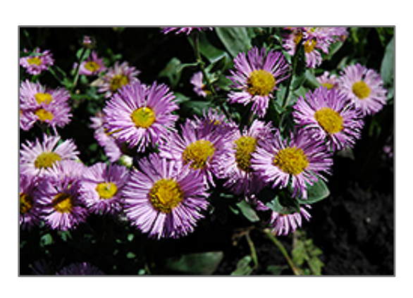
Pink Jewel Fleabane flowers

Beautiful bushy green foliage features tall sturdy stems of bright rosy-pink daisy like flowers with large, yellow center discs; drought tolerant and easy to grow, perfect for borders, beds and fresh-cut arrangements; deadhead to encourage new growth