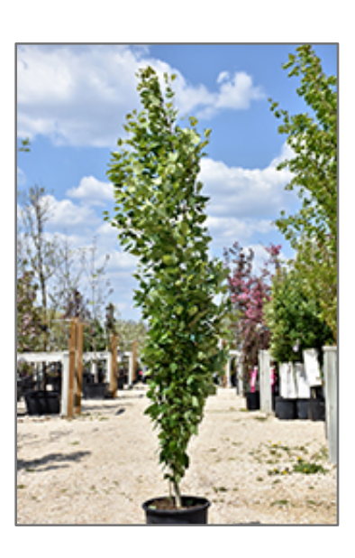
Prairie Skyrise Aspen