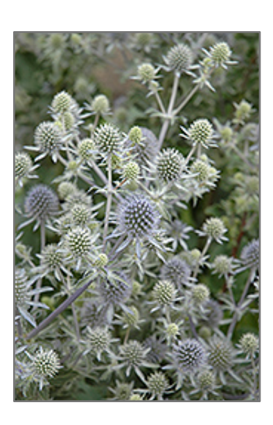
Alpine Sea Holly flowers