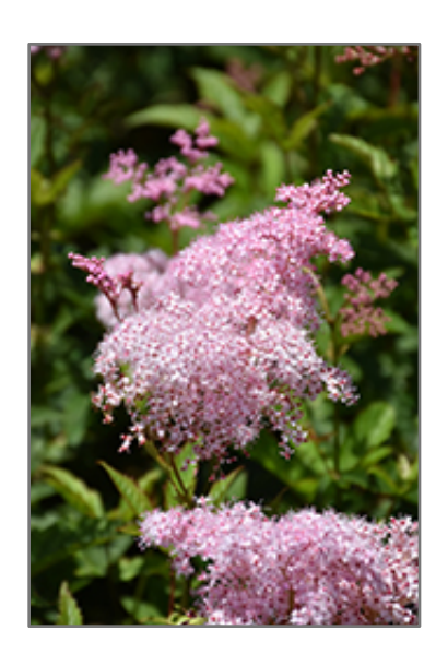
Queen Of The Prairie flowers