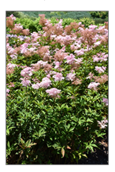
Queen Of The Prairie in bloom