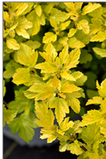
Tiny Wine Gold Ninebark foliage

Tiny Wine Gold Ninebark is recommended for the following landscape applications;