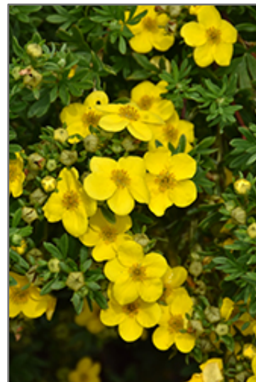
Happy Face Yellow Potentilla flowers

Happy Face Yellow Potentilla is recommended for the following landscape applications;