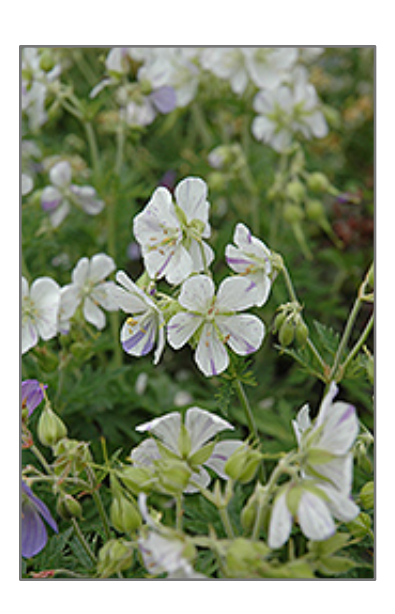
Splish Splash Cranesbill flowers

Masses of white flowers with purple stripes and speckles sit atop deep green foliage during the early summer months; drought tolerant once established, excellent for borders, beds and containers; remove spent flowers to encourage new growth