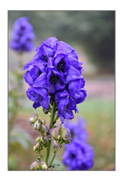
Barker's Variety Monkshood flowers

This stunning variety has incredible, tall spikes of deep violet-blue hooded flowers that appear in late summer and early autumn, above lovely green, glossy foliage; an excellent cut flower that prefers a site that will not dry out in summer