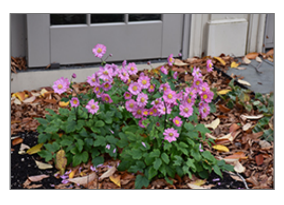
Pamina Anemone in bloom

This is a relatively low maintenance plant, and is best cleaned up in early spring before it resumes active growth for the season. Deer don't particularly care for this plant and will usually leave it alone in favor of tastier treats. It has no significant negative characteristics.