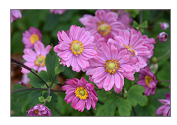
Pamina Anemone flowers

Pamina Anemone is a dense herbaceous perennial with an upright spreading habit of growth. Its relatively fine texture sets it apart from other garden plants with less refined foliage.