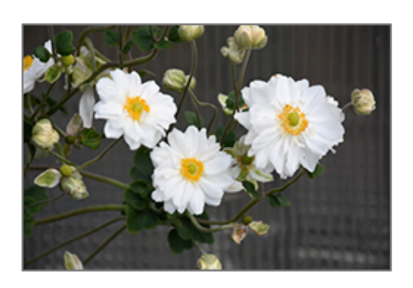
Whirlwind Anemone flowers

Elegant white semi-double flowers rise high above dark green foliage on graceful stalks; windflowers are perfect for naturalizing, swaying gently in the wind and blooming at the end of the season; lovely when massed along borders or in containers