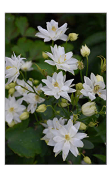
Clementine White Columbine flowers

Dainty, upward facing white flowers resemble double-flowering clematis; on a compact, many-branched plant; makes a welcome addition to shade and woodland gardens