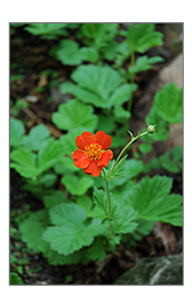
Werner Arends Avens flowers

A compact selection that features low growing mounds of lush green foliage and tall stems of rich orange semi-double flowers; low maintenance variety, perfect for borders, butterfly gardens and containers; good cut flower