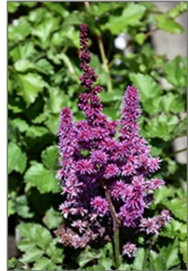
Purple Rain Chinese Astilbe flowers

This variety produces showy dark magenta plumes with a purple-lavender cast, rising above deep green leaves; dense, upright form; perfect in a shady spot with dappled light; prefers moisture so water regularly for abundant flowers and nice foliage