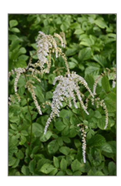
Professor Van Der Wielen Astilbe flowers