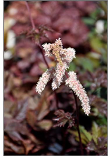
Chocolate Shogun Astilbe flowers

This is a relatively low maintenance plant, and is best cleaned up in early spring before it resumes active growth for the season. It is a good choice for attracting butterflies to your yard, but is not particularly attractive to deer who tend to leave it alone in favor of tastier treats. It has no significant negative characteristics.