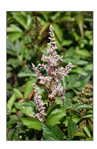
Look At Me Astilbe flowers

Vivid bubblegum pink colored plumes rising above deep green leaves, on ruby red stems; perfect in a shady spot with dappled light; prefers moisture so water regularly for abundant flowers and nice foliage