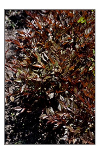
Mars Astilbe foliage

Vivid pink colored plumes rising above deep burgundy leaves, on dark red stems; perfect in a shady spot with dappled light; prefers moisture so water regularly for abundant flowers and nice foliage