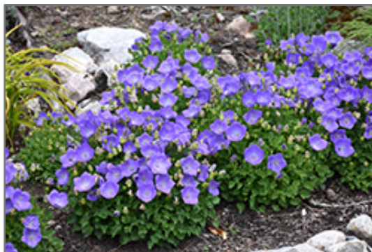
Rapido Blue Bellflower in bloom