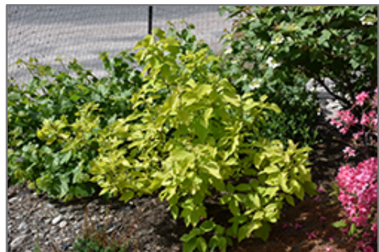
Neon Burst Dogwood