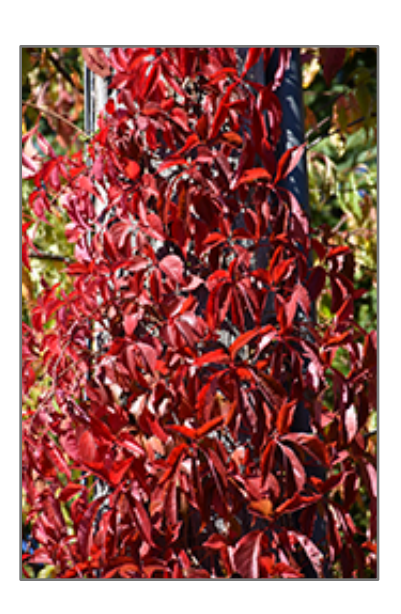
Red Wall Virginia Creeper in fall