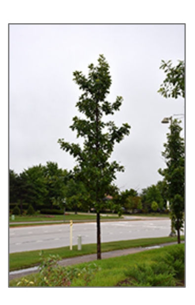
Urban Pinnacle Bur Oak