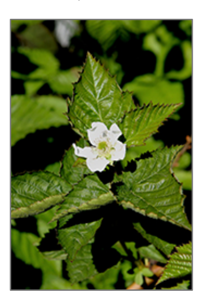
Jostaberry flowers