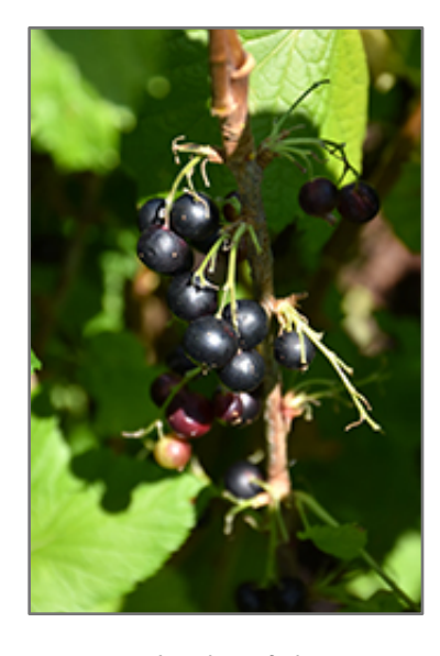
Jostaberry fruit

Jostaberry has rich green deciduous foliage on a plant with an upright spreading habit of growth. The lobed leaves turn yellow in fall. It features an abundance of magnificent plum purple berries in early summer, which fade to black over time.