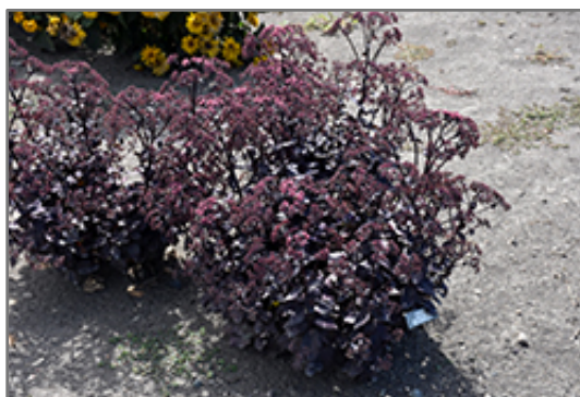
Cherry Truffle Stonecrop in bloom