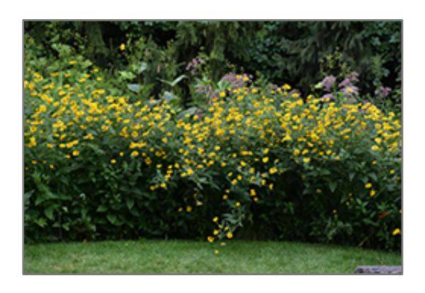
False Sunflower in bloom

This is a relatively low maintenance plant, and is best cleaned up in early spring before it resumes active growth for the season. It is a good choice for attracting butterflies to your yard. It has no significant negative characteristics.