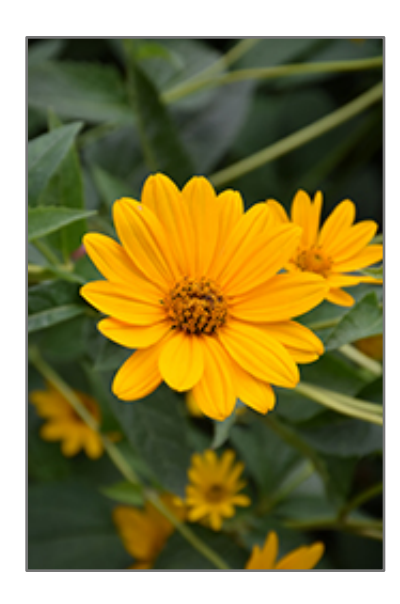
False Sunflower flowers

False Sunflower is an herbaceous perennial with an upright spreading habit of growth. Its medium texture blends into the garden, but can always be balanced by a couple of finer or coarser plants for an effective composition.