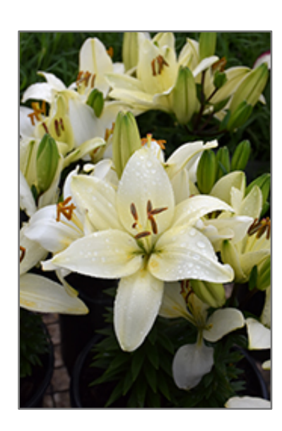
Lily Looks Tiny Crystal Lily flowers

This variety is a compact lily that bears well formed, upward facing, crystal clear white blooms with a hint of green; perfect for containers or massing along borders; they are also known to have multiple blooms per stem