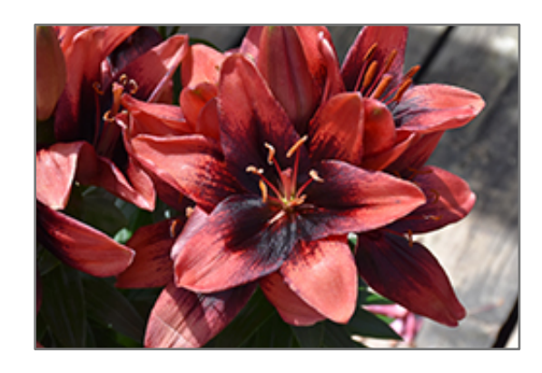
Lily Looks Tiny Shadow Lily flowers