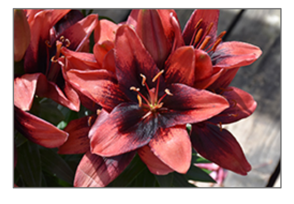
Lily Looks Tiny Shadow Lily flowers