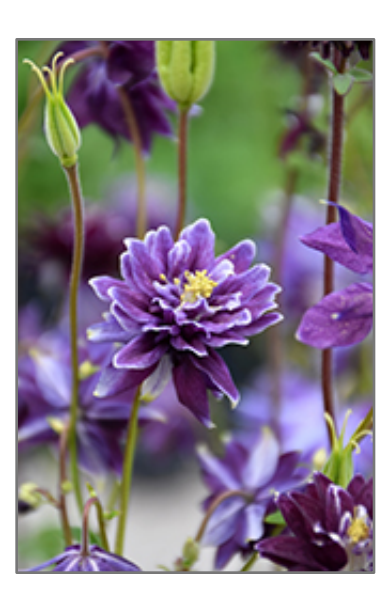
Christa Barlow Columbine flowers

A unique variation of Columbine, featuring fluffy double flowers of deep blue edged in white, on nodding stems, well above the lacy green foliage mound; wonderful for containers or border edging