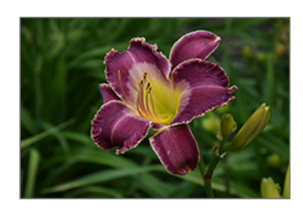
Chicago Regal Daylily flowers

Striking purple colored trumpets with a picotee, pie-crust edge; yellow-green throat; sturdy, strong, easy to care for, great grassy texture and form; tetraploid; good for the beginner gardener and the pro