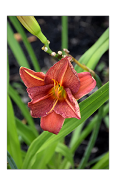
Chicago Ruby Daylily flowers

Chicago Ruby Daylily features bold lightly-scented ruby-red trumpet-shaped flowers with chartreuse throats at the ends of the stems from early to mid summer. The flowers are excellent for cutting. Its grassy leaves remain green in colour throughout the season.