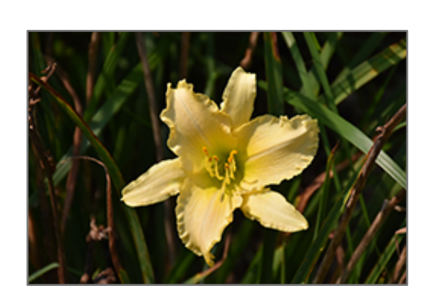
EveryDaylily Cream Daylily flowers

This reblooming, dwarf daylily has light creamy-yellow trumpets with a yellow-green throat; pretty ruffled blooms; sturdy, strong, easy to care for, great grassy texture and form; great for containers, beds, and borders