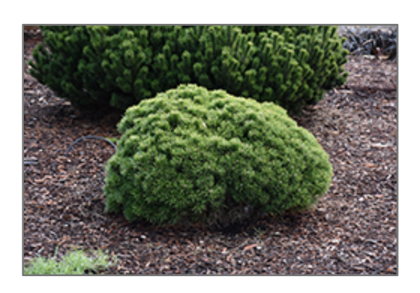
Palouse TRUdwarf Mugo Pine

A dwarf version of this species which grows slowly into an upright rounded form; longer, emerald green needles pack the dense branchlets of this choice garden evergreen; can be kept smaller and more refined, with annual candle pruning