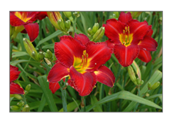
Chicago Apache Daylily flowers

Rich scarlet red flowers with slightly ruffled edges bloom during the mid summer months; tall flower stalks rise above mounds of green arching foliage; an elegant addition to borders, beds and containers; low maintenance and drought tolerant