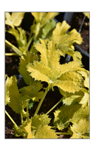
Neptune's Gold Sea Holly foliage