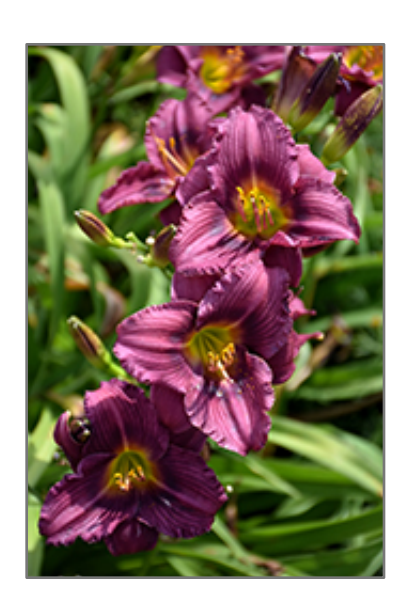
Little Grapette Daylily flowers

A compact variety producing small grape-purple trumpets with chartreuse throats and rose flares reaching out to nicely ruffled edges; great grassy texture and form; diploid; a perfect addition to a smaller garden or border space