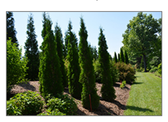
Thin Man Arborvitae

Thin Man Arborvitae is recommended for the following landscape applications;