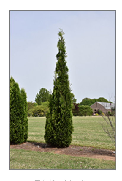
Thin Man Arborvitae

This is a relatively low maintenance shrub. When pruning is necessary, it is recommended to only trim back the new growth of the current season, other than to remove any dieback. It has no significant negative characteristics.